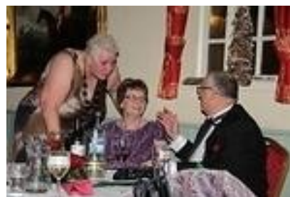
MGOC 1009 XMAS DANCE 2011 "Walhampton".