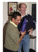
Club bowling night