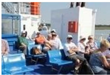
Moor to Sea run .